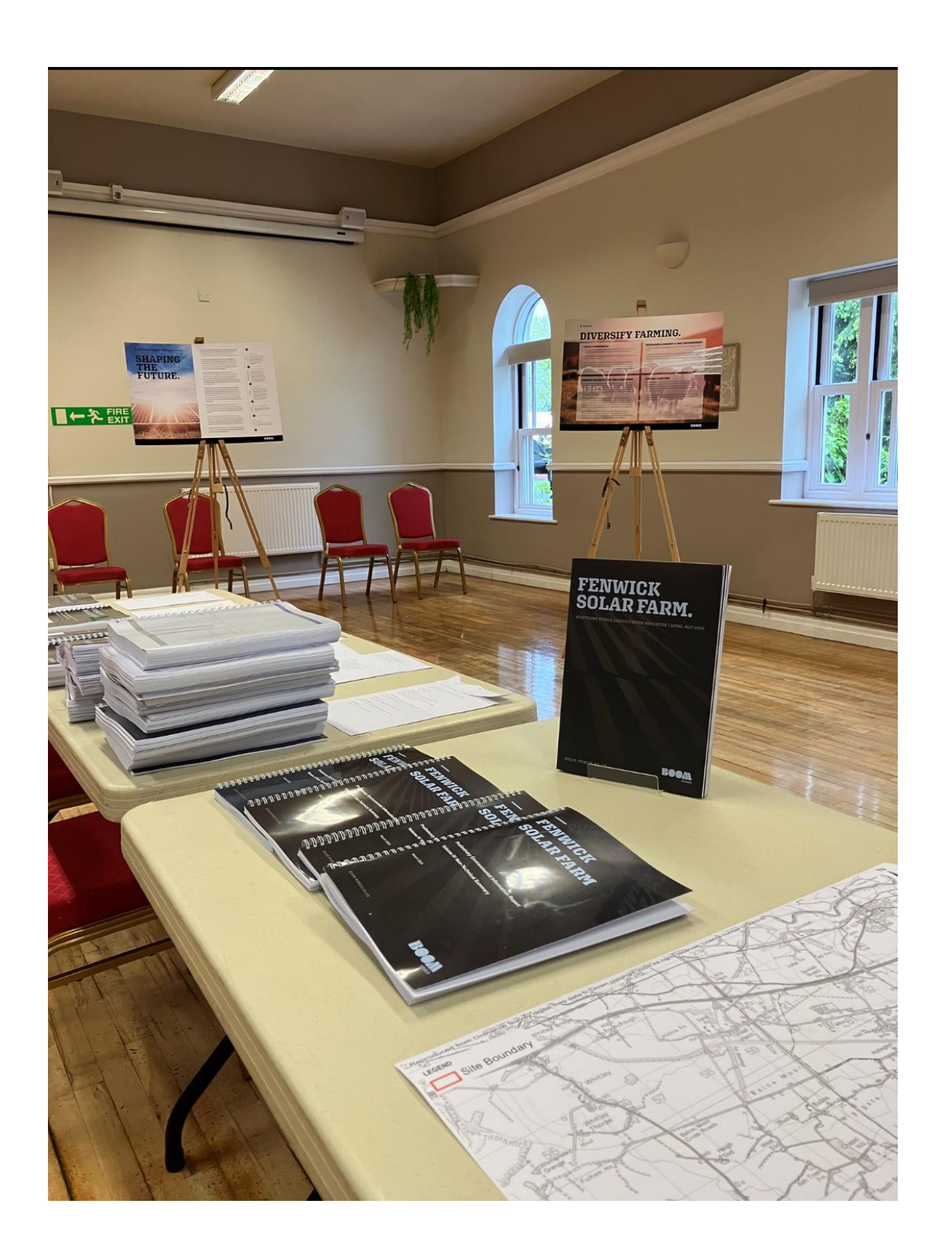
Figure 1-1: Evidence of the consultation event held at Askern Town Hall, Friday 26 April 2024